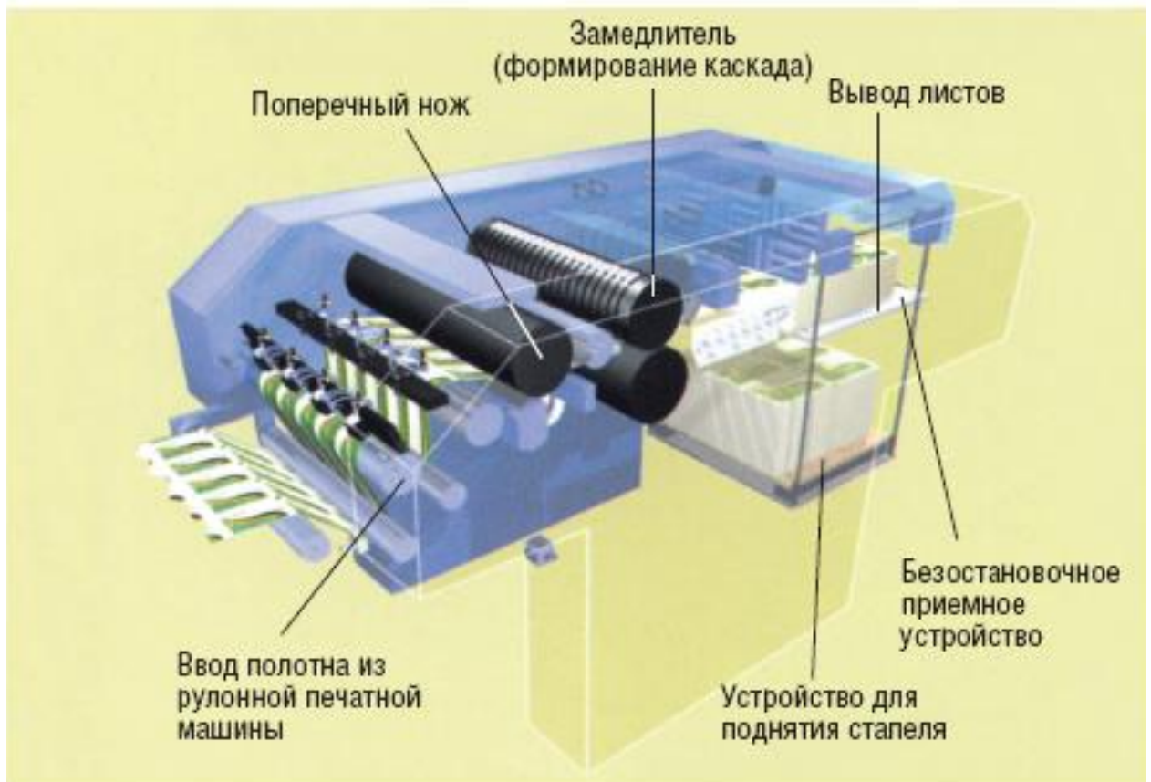
Схема устройства листового выклада VITS ROTOCUT.